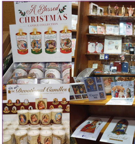
Just some of the goodies and gifts that are available in our very well stocked Repository. Please pop in before or after Mass and have a browse. No supply chain shortages or lack of lorry drivers here!"

Volunteers are warmly welcome to join the first weekend convoy to Calais since Jan 2020, to support the three charities who are working there with refugees living in dire conditions. It is the fifteenth Calais Light trip, and first time volunteers will be well briefed and supported. The dates are Friday 26th - Sunday 28th November, and there will be a maximum of 30 people. To apply, you must be double vaccinated. Download the pdf version of your digital Covid Pass from the NHS app & email it to calaislight@yahoo.com before the deadline of Wed 27 Oct. You will then be contacted about booking. More information at www.calaislight.com