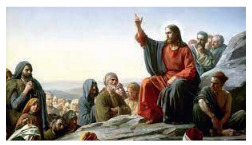
"Rejoice and be glad, for your reward will be great in heaven"

Welcome to our parish news of St. Joseph the Worker 29 January 2023