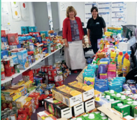
This takes place at St. Georges Church in Ongar every Saturday between 10.00 a.m. and 12 noon. The Food Hub is also available at St. Peters in Hutton.