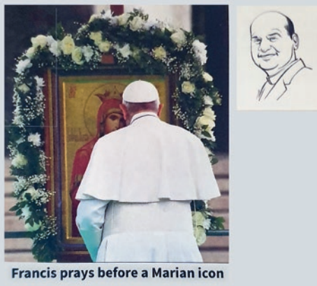
Francis prays before a Marian icon

During the last few days of Advent, please consider praying the Rosary.