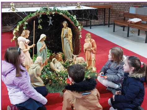
St. Joseph schoolchildren pictured around our beautiful crib.