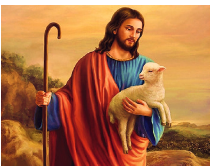
"My sheep hear my voice: and I know them, and they follow me.".