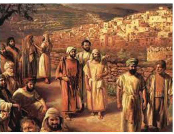
"The seventy-two returned rejoicing, and said, "Lord, even the demons are subject to us because of your name.""