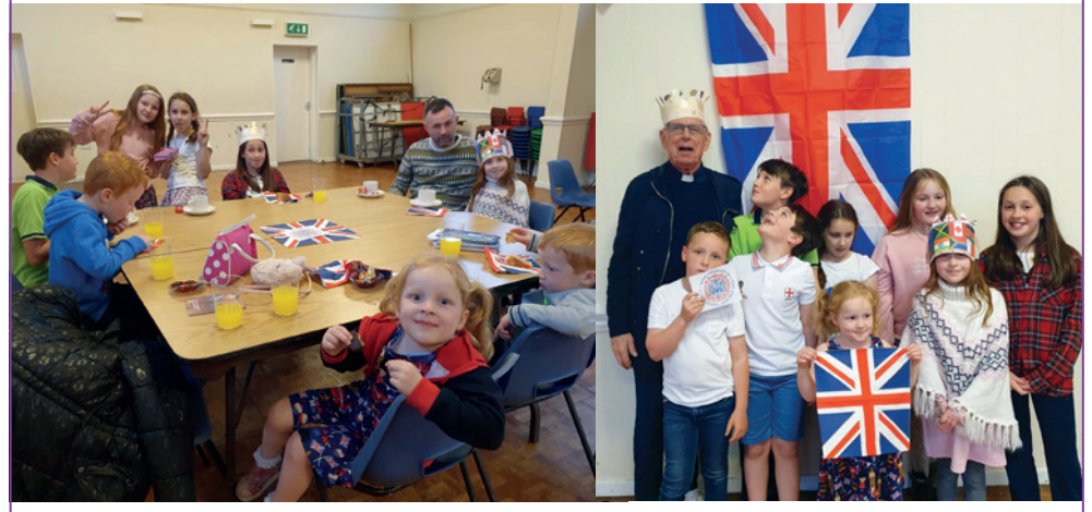
We held a Coronation Tea Party after both Masses last weekend, and a great time was had by all!